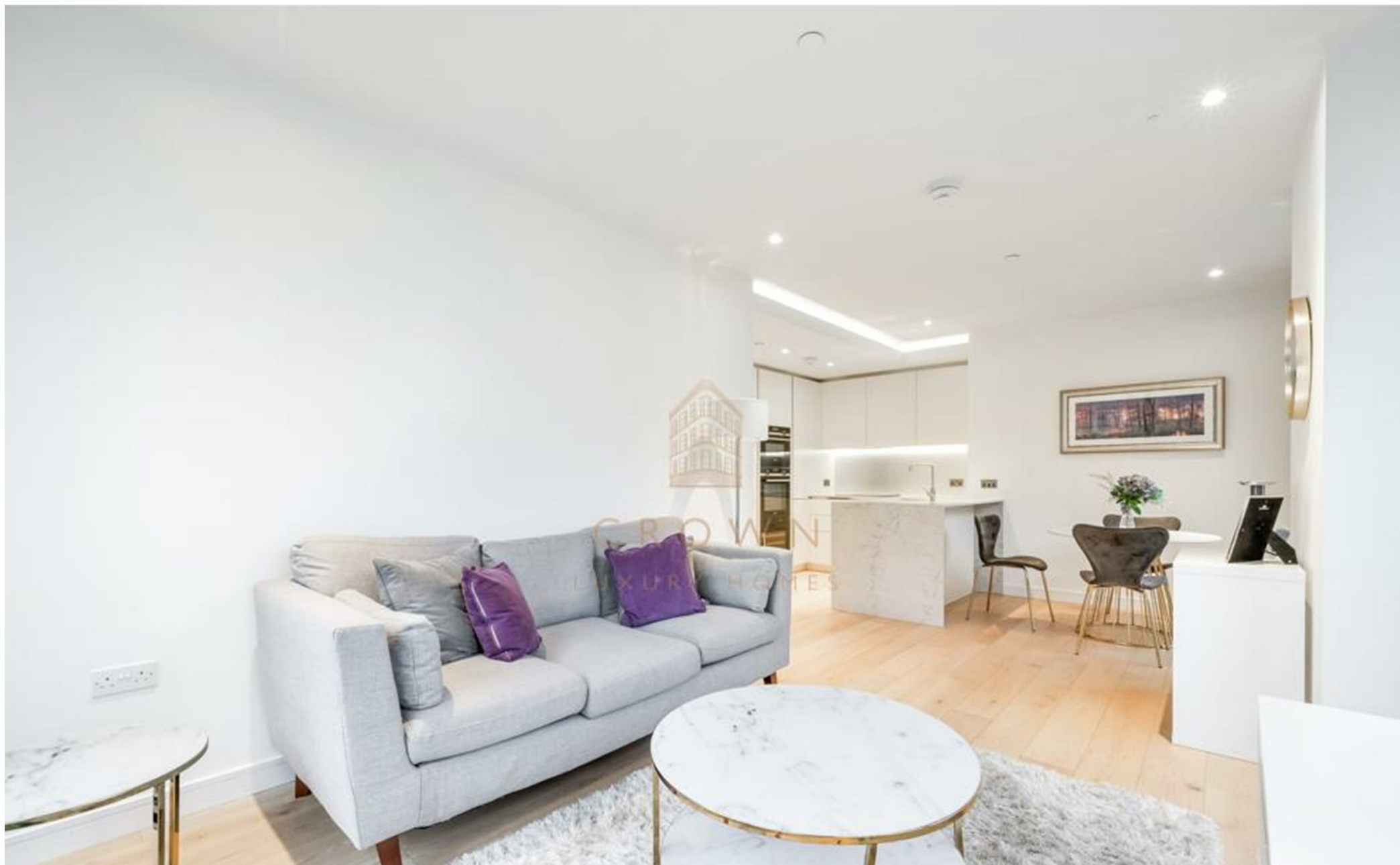
Apartment 2501, Hampton Tower 75 Marsh Wall, London, E14 9RA £4,500 Per month